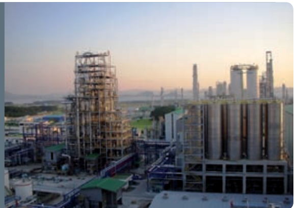
Spherizone plant – SamsungTotal, Daesan, South Korea

LyondellBasell's breakthrough Spherizone multi-zone circulating reactor process provides an economical and efficient method of manufacturing a wide range of high-quality polypropylene and novel, propylene-based polyolefinic resins. Since the launch of the Spherizone process in 2004, more than three million tonnes of capacity have been licensed.